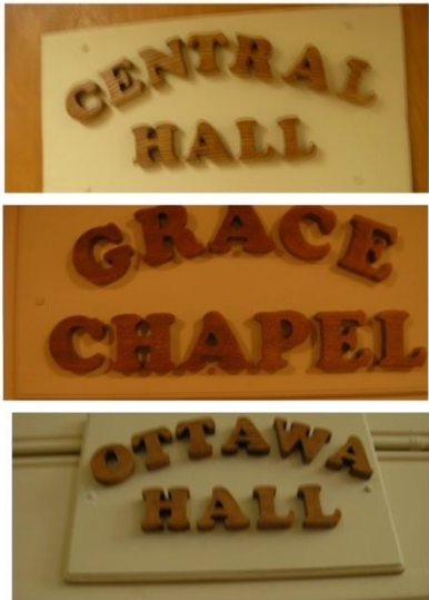
The Emmanuel United Church congregation has just recently been greatly enhanced by the addition of folks from Central United Church. But, this is just the LATEST enhancement of EUC. In 1997 we benefitted greatly by the addition of new members from Grace United Church. And, before that, in 1956 the former Ottawa United Church became Emmanuel United Church with the opening of the new sanctuary addition. Thus, we can brag that the foundation of our existing Emmanuel United Church is based upon the three former congregations – Ottawa United; Grace United, and Central United. To commemorate this union, our building now boasts the “OTTAWA HALL”, “GRACE CHAPEL” and the recent “CENTRAL HALL”.